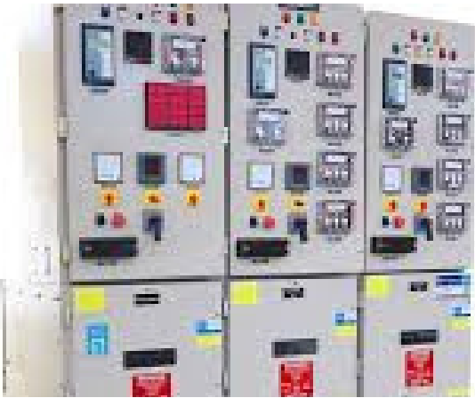
11KV HT PANEL