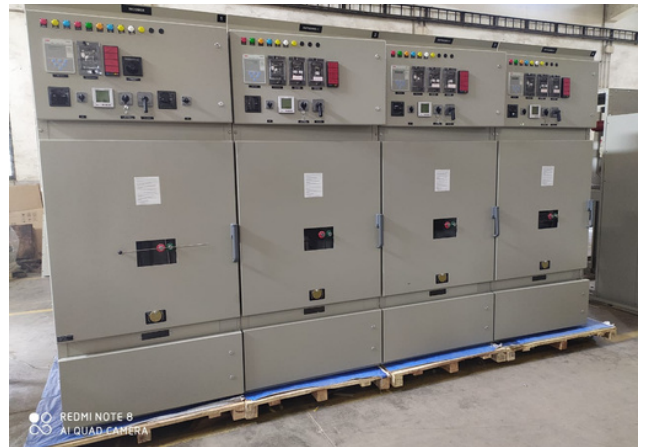
33KV HT PANEL