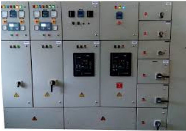
DG CONTROL PANEL