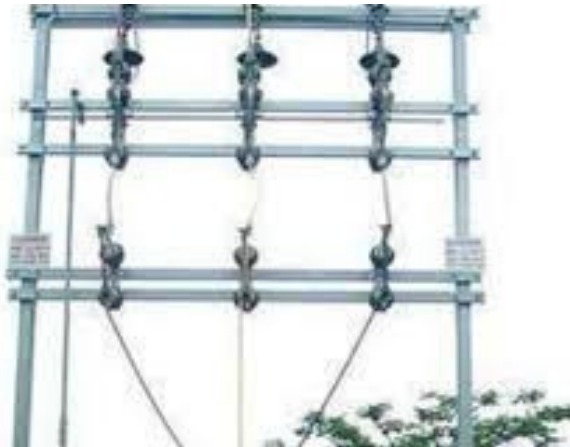
TWO POLE STRUCTURE